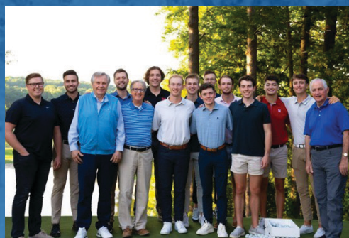
Members at the GlenArbor retreat.

For alumni having updated contact information or questions about TEC, send an email to updates@nebraskabeta.com .