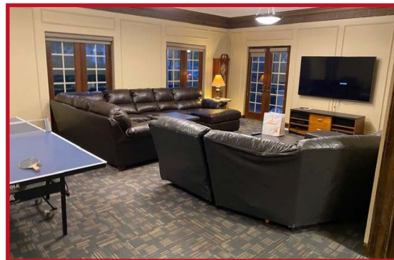
New living room couch purchased by Beta Parent Alliance.