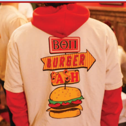
Burger Bash is a November activity where other living units come to the Beta house for good burgers and trimmings. Lighthouse, a program for at-risk Lincoln youth, is the beneficiary of this annual event.