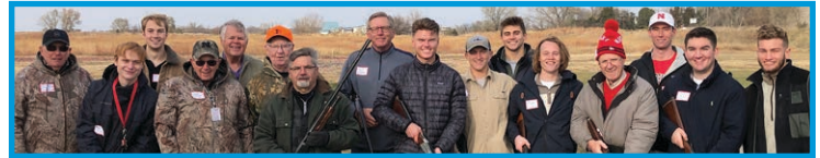
Beta Men at a trap shoot last November.

Alumni news can be emailed to updates@nebraskabeta.com . "Normal" deadlines for the spring and fall editions of The Dragon's Tale would be about March 1 and October 1 of each year. If you have news about yourself or other Alpha Tau Betas you would like to share, we encourage the submissions.