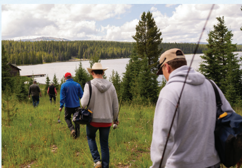
Brothers kick off their fishing trip.