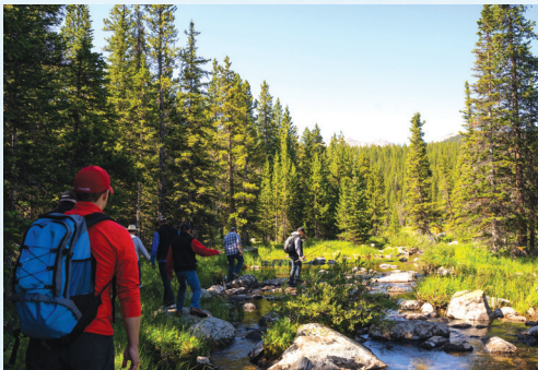
A trek through the beautiful Wyoming wilderness.