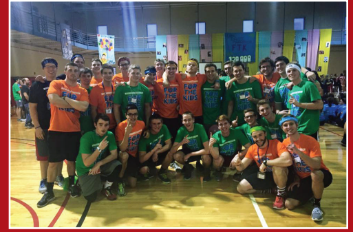
Members enjoyed participating in UNL's annual Children's Miracle Network dance marathon event.