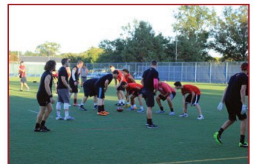
Actives (wearing black) and pledges (wearing red) line up for the annual pledge versus active football game.