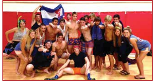
Beta Theta Pi partnered with Delta Gamma for their Anchor Splash philanthropy.