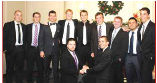
Senior members during Alpha Tau's formal in December.