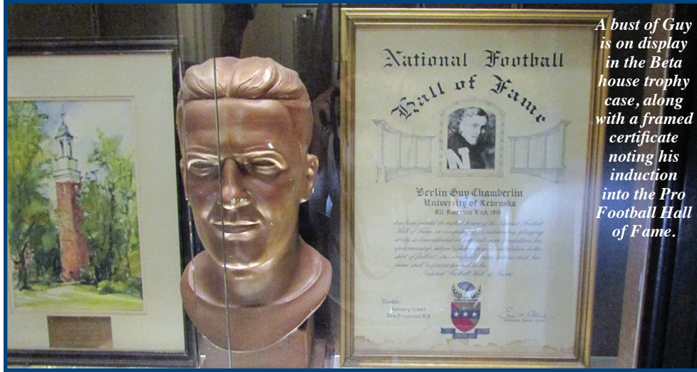
A bust of Guy is on display in the Beta house trophy case, along with a framed certificate noting his induction into the Pro Football Hall of Fame.