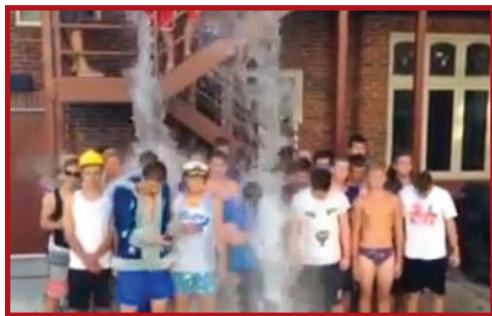
Beta was challenged by FarmHouse to take part in the ALS ice bucket challenge. We accepted the challenge and nominated Phi Delta Theta and Alpha Phi!