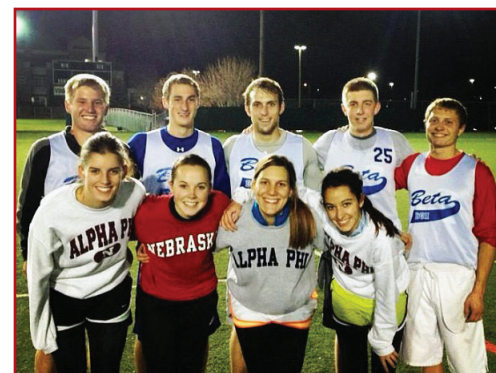
Beta and Alpha Phi intramural soccer champions.