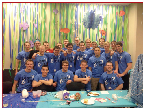
Undergraduates participate in Dance Marathon.