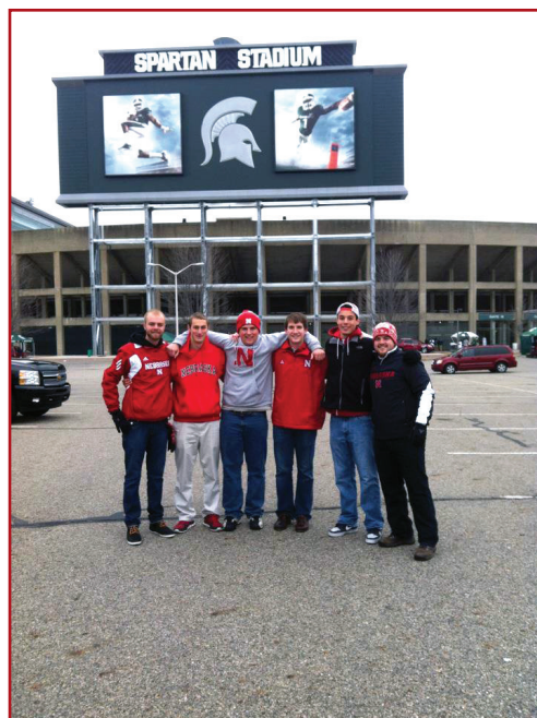
Betas travel to MSU for football game.

We have enjoyed many successes this past year. Alpha Tau won seven intramural championships, three of which were in soccer and one was an All-University Championship.