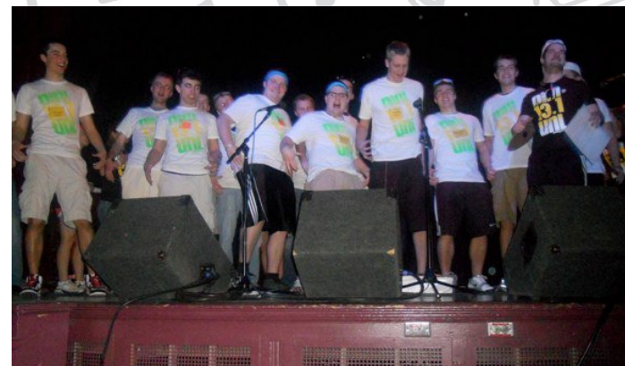
Beta takes the stage at UNL Dance Marathon, being ac- knowledged for having raised the most money out of any other student organization by a very wide margin.

This quote sums up the dedication and incredible impact made by twenty five Beta men for a truly wonderful cause.