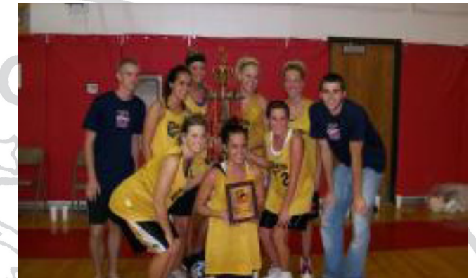
Kappa Alpha Theta celebrates the tournament victory with their Beta coaches

Alpha Tau chapter continued their commitment to community this past fall by hosting two philanthropic events on the University campus. On October 12th Beta held the 3rd annual Queens of the Court tournament in partnership with Farmhouse Fraternity. A sorority basketball tournament in which girls compete to raise money for the Lincoln Food Bank. Eleven teams participated in the tournament this year, and Kappa Alpha Theta took the championship and the newly established Queens of the Court travelling trophy. This year's event resulted in 1,052.10 dollars being donated to the Lincoln Food Bank. Overall the event