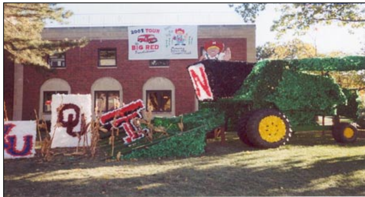
The Homecoming Display of 2001 took 1st place in the University of Nebraska Homecoming Competition.

In addition to dominating the homecoming competition, Alpha Tau placed 1 st in the fraternity category of Delta Gamma Sorority's annual Anchor Splash Philanthropy. The competition involved fundraising for some worthy causes, and was capped off by swimming races and the all-revered synchronized swimming competition.